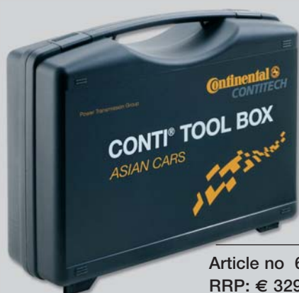
Article no 65 76 476 000 RRP: € 329.00 + VAT

Please give us a call if you have any questions: Tech. hotline +49 511 938-5178