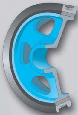
Torsional Vibration Damper (TVD)