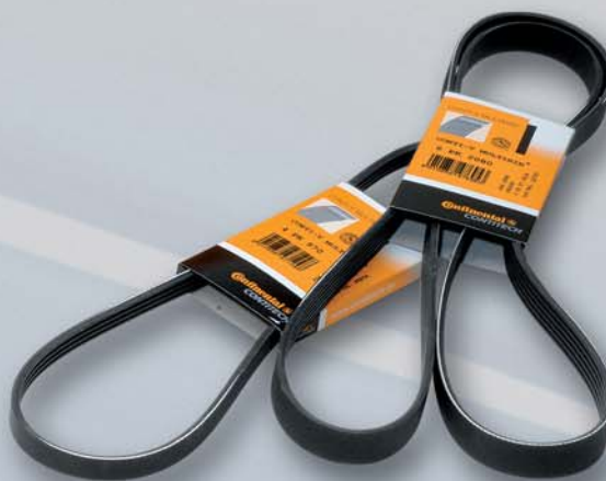
CONTI-V MULTIRIB® belts